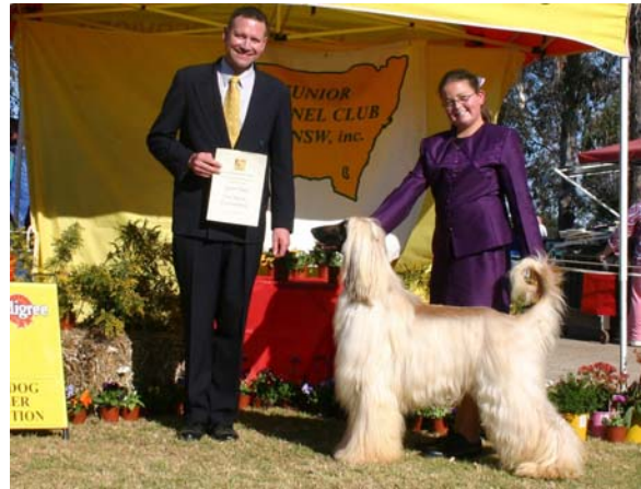
before bathing in Animal House

I have 3 Afghans in full coat each a different coat type and colour 1 Silver, 1 Black & Tan and 1 Butterscotch Brindle. I bath the three of them in Pure Alternative using the recommended dilution of 5:1 and find it to be an excellent product. Not only does the silver in the three coats sparkle but the coats gleam with healthiness. After bathing the dogs I add Purely Silk conditioner which I leave in, the coats are soft & flowing without the feeling of heaviness I have had with other products.