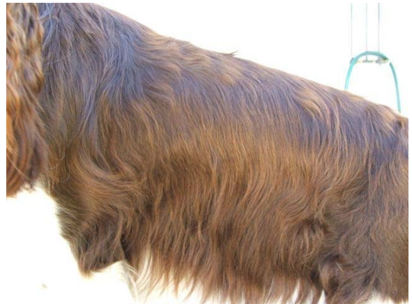
Before bathing in Animal House

I have a young English Springer Spaniel bitch, (almost 3) & I have tried many products on her coat...always looking for the ultimate product. Some products made her coat feel tacky, while others made her feel wonderful for show day. Unfortunately over a period of time, these products seemed to gradually ruin her coat.