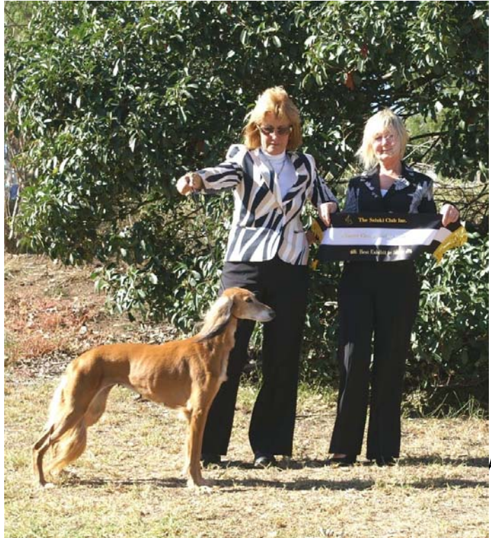
Best In Show Saluki Club Champ Show Easter 2006