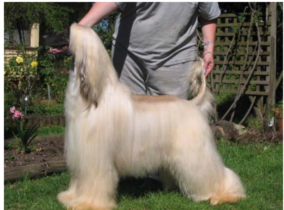
After bathing in Animal House

All in all I am thrilled with the results these products have given and look forward to receiving my order of the Leave in Lustre of which I am sure I will be equally impressed.